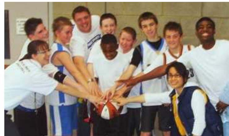
MK SPEEDERS- Team + coaches hands in– Friendly at Shenley Basketball Club , January 2007

Followed by a home game series against these teams. Plus home & away games against a team from north Oxford.