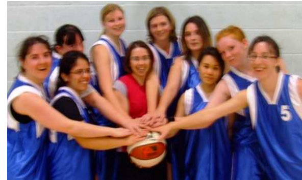
MK Ladies “Hands In”