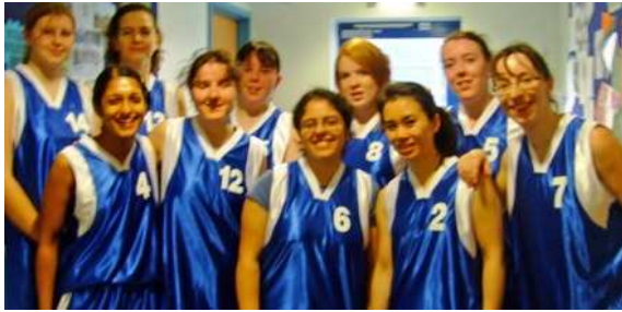
MK Ladies League Team